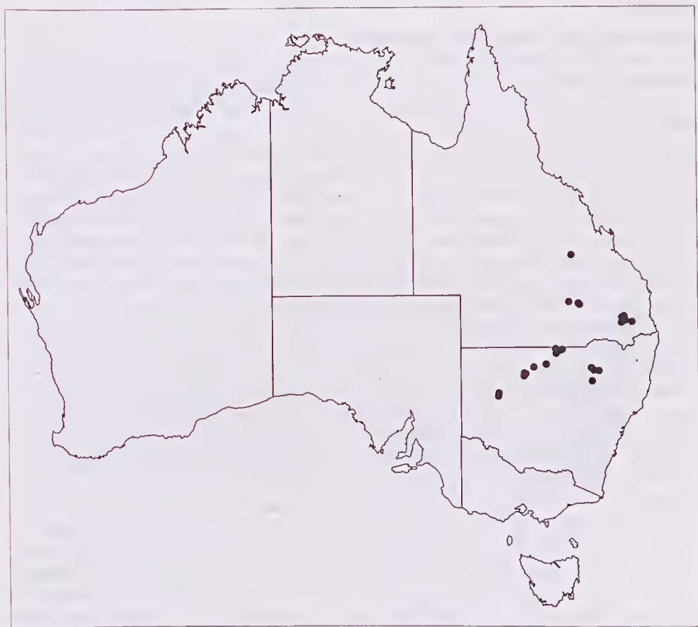
Fig. 2. Distribution of specimens of Cymbonotus maidenii in Australia based on BRI, NSW and CANB specimens.

Illustrations: Gaudichaud, Voy. Uranie , plate 86 (1826); Beauverd, Bull. Soc. Bot. Geneve ser. 2, 7: 45, fig. 4 (1915); Murray, in Harden (ed.) Fl. NSW 3:319 (1992); Jeanes, in Walsh & Entwistle (eds) Fl. Vic. 4:718, fig. 138e (1999); Stanley & Ross, Fl. SE Qld 2:578, fig. 81E (1986).